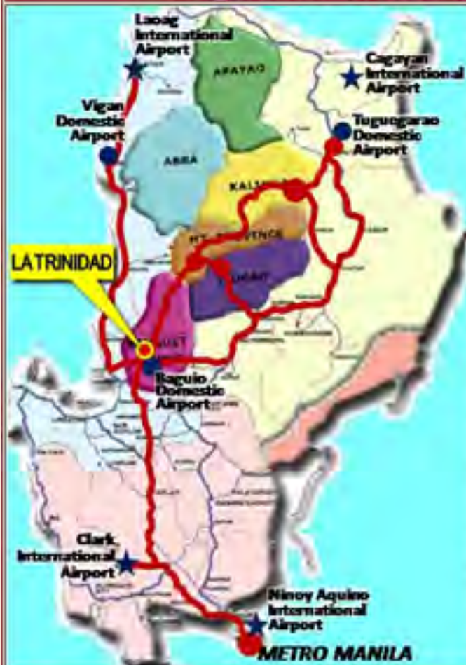
Figure 1.1. Access & Travel Time to La Trinidad